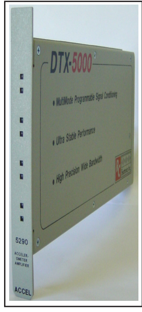
6290 Four Channel Extended Range ICP Conditioner

The 6290 provides programmable gain range of 1 to 2000 with a full 400 kHz bandwidth. A programmable constant-current source provides excitation power to sensors with internal integrated amplifiers, and a programmable calibration voltage source is available for establishing baseline values before and after a test is run. Front-panel LEDs indicate signal presence and warn of overload conditions and module operational problems. Stable low temperature-coefficient components are used to maintain system accuracy over a wide temperature range, and all circuitry is housed in a shielded enclosure for improved reliability and noise reduction.