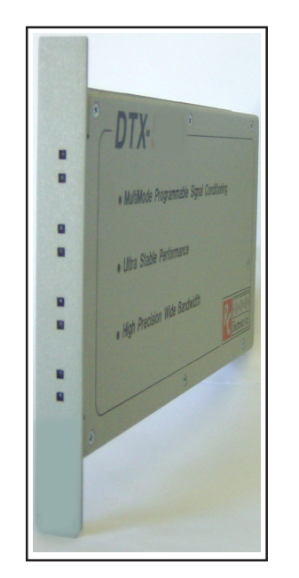
6322 Four Channel Extended Range Instrumentation Amplifier

The 6322 utilizes onboard DSPs (one per channel) to configure the input circuitry and handle amplifier gain and offset compensation. A mechanical latching relay is used to select AC or DC coupling to ensure that the input signal is not affected by the switching circuitry. High performance front-end analog components are combined with digital signal processing techniques and an ultra-stable calibration reference source to maintain system accuracy. Front-panel LEDs indicate signal presence and activity level, and warn of module operational problems. All circuitry is housed in a shielded enclosure for improved reliability and noise reduction