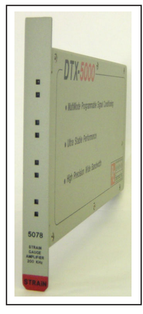
5078 Automated Strain Conditioner

On-board bridge-completion resistors are provided for full, ½, or ¼-bridge completion to accommodate a variety of sensor configurations. Bridge configuration is completely programmable, including the selection of 120 or 350 ohm completion resistors. By setting the configuration to the Full Bridge mode, the 5078 can also be used as a standard differential amplifier.